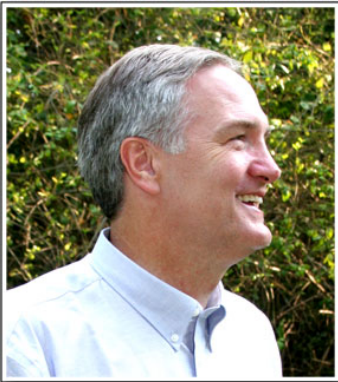
Picture and background information from http://www.lutherstrange.com/contents/about/index.shtml

We have great speakers for August and September. Don't miss these great Republicans!